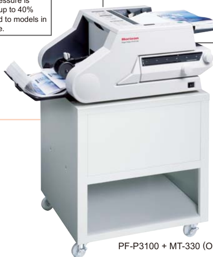
PF-P3100 + MT-330 (Option)

In the high-speed mode, the folding speed is increased by 40% over models in this range.